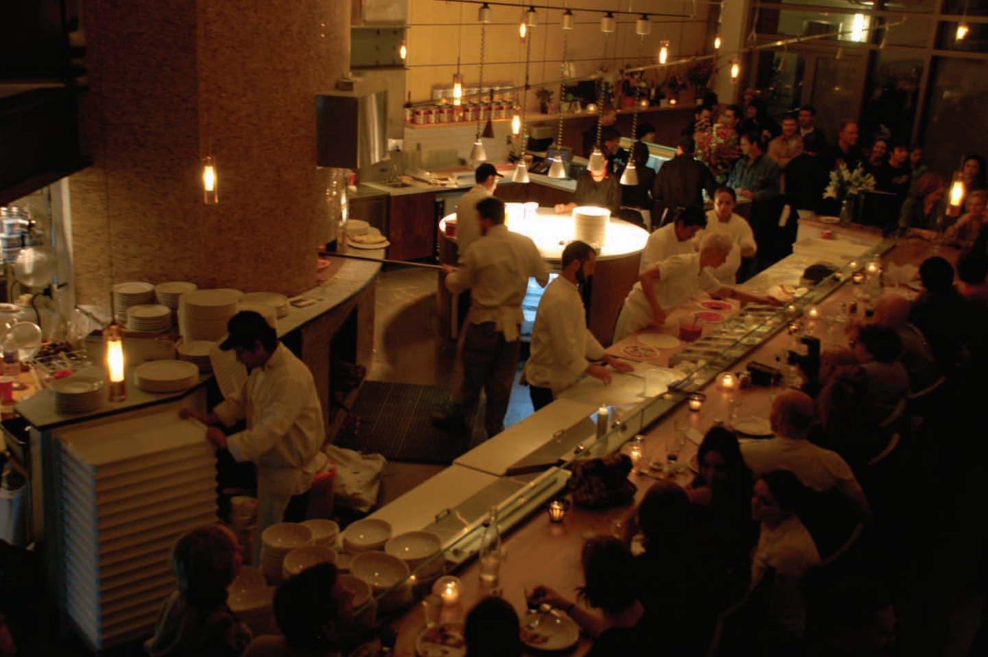
Another busy night at one of the newest Tutta Bella Neapolitan Pizzerias.